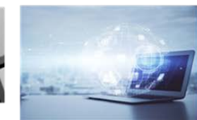
Virtual Classroom Operational Readiness