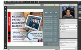
Facilitating Virtual Classroom using Adobe Connect