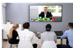
Facilitating Virtual Classroom Learning Face to Face Session -Optional