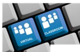
Virtual Classroom Administration Training