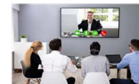
Trainer Coaching and Accreditation