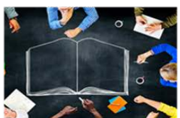
Designing learning for a Virtual classroom environment.