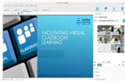
Facilitating Virtual Classroom using Cisco Webex Training Center